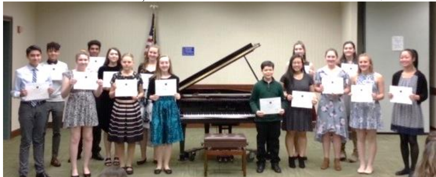
All Event Participants