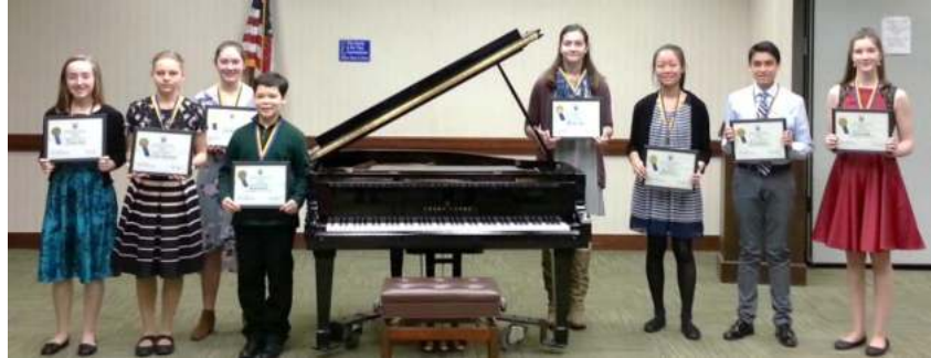
$75 Level Winners